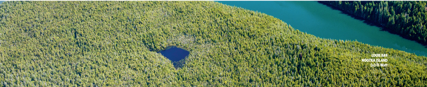
LOUIE BAY NOOTKA ISLAND

THE MOSSY MAPLE GROVE west of Lake Cowichan is an unprotected old-growth deciduous rainforest of giant bigleaf maples draped in hanging mosses and ferns - and filled with grazing elk.